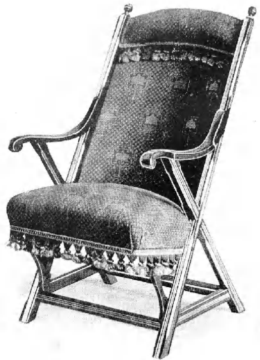
Figure 3 No 78 Victoria Easy Chair

Matthews & Co did not make many armchairs or sofas, but they did produce several designs of easy chair (Figure 3). The Victoria easy chair, with a style that suited its name, was evidently popular as it continued to be made throughout the life of the company. In 1909, Albert Matthews patented a chair with a sliding seat and tilting back that automatically adjusted to the way a person was sitting (Figure 4). This invention was used in the Bathurst Easy Chair, which also had a sliding leg rest that could be hidden under the seat or pulled forward for use, and the combination of these two features made this chair particularly popular (10).