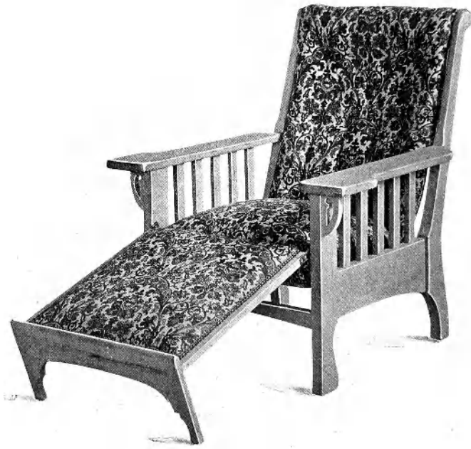
Figure 4 No 541 Bathurst Easy Chair)

the clothes to be pulled forward to aid access to those at the back. This sold well initially but was soon discontinued – presumably because it did not live up to expectations (11).