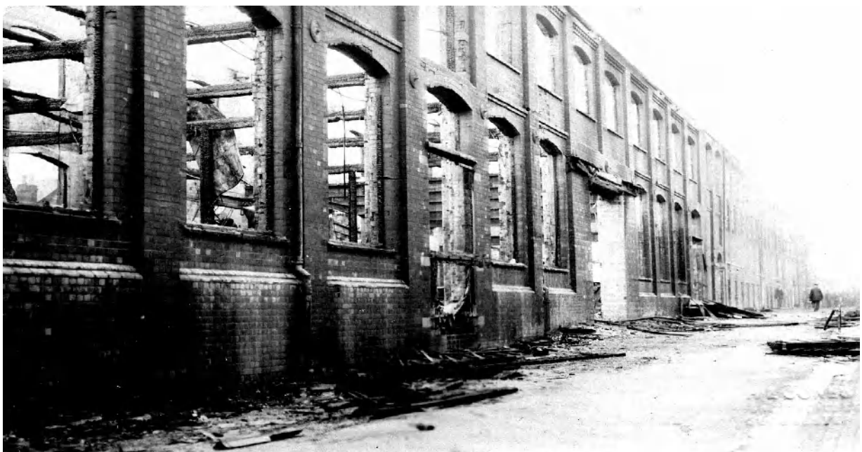
Figure 5 Mathews factory after the fire of 25 July 1912

The company quickly made arrangements to continue some production in temporary premises, but many of their employees had to be laid off. At the same time, they placed a contract for rebuilding the factory and ordered the latest designs of woodworking machinery. They also took the opportunity of installing a sprinkler system supplied from a huge roof-top tank which was a feature of the skyline for many years (13).