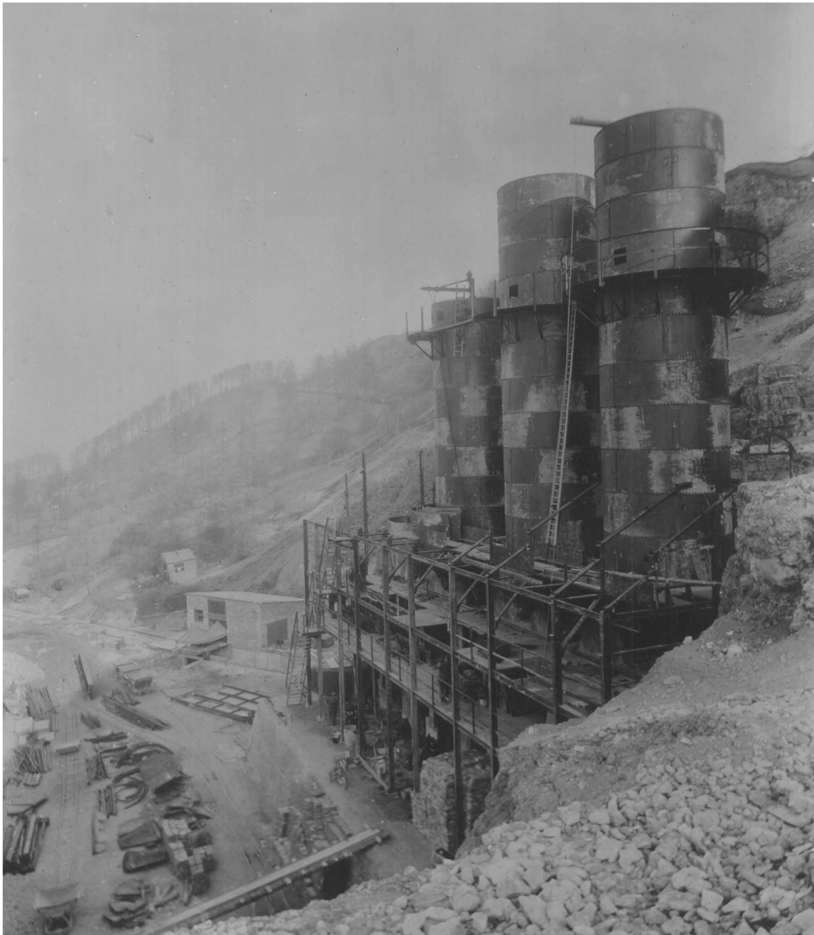
Plate 1 The Focal Point of the Railways (C2) in 1924 Showing the Four Limekilns (D1) Under Construction (looking north-east).

The Electrical Plant House (D3) is to the Left of the Kilns.