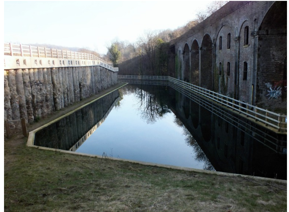
Recent diversion of the Thames and Severn Canal at Capels Mill Stroud [see talk and visit]

47 th South Wales & West of England Regional Industrial Archaeology Conference.