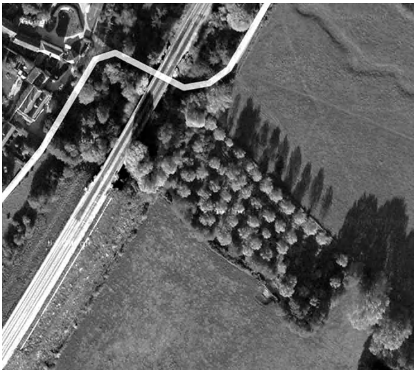
Figure 8 Aerial view of the site c.2007 from Google Maps. The individual mature trees can be clearly seen. [Note the overlay showing the road to Beards Mill has been included to comply with Google Terms and Conditions].

Cricket bat willows are normally grown from long cuttings called sets, raised in special 'stools' or 'tods' that are planted in the ground, ideally near a fresh water stream. When laid out in plantations, they are set in rows around 4 inches apart as they need plenty of air and light (Figures 3, 4 and 5). The sets are allowed to grow and are cropped every fourth year. Particularly during the first year, they require careful weeding and maintenance in order to prevent the young shoots being overrun with undergrowth. To produce knot-free timber, all shoots and