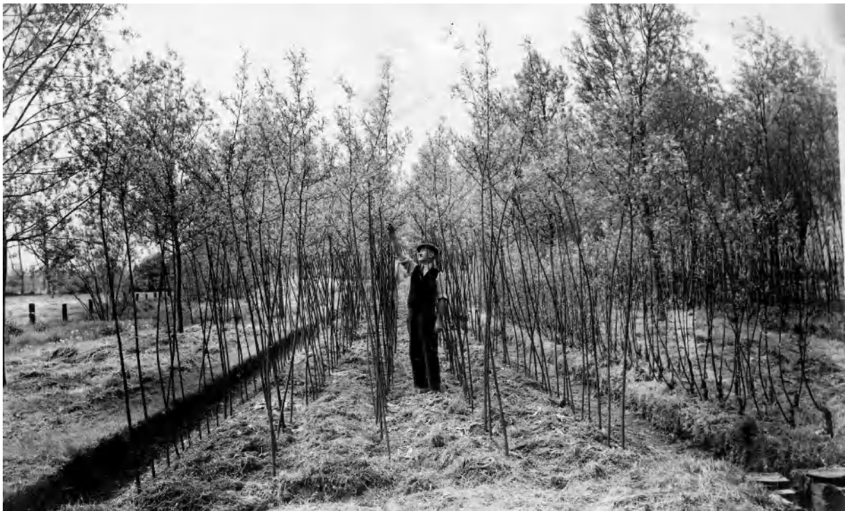
Figure 4 As Figure 3.