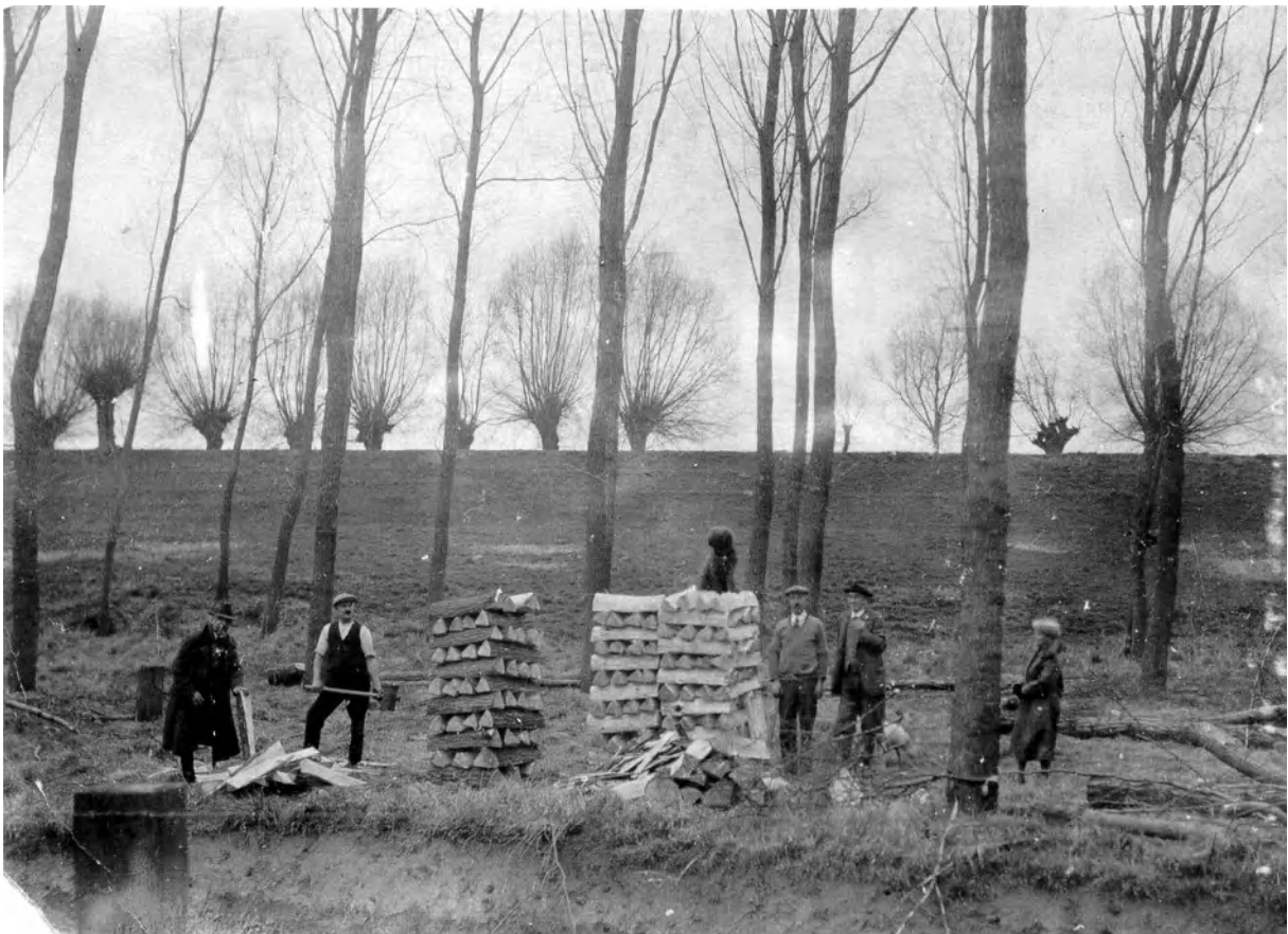
Figure 6 Willows at Stonehouse Court being cut in readiness for cricket bat production