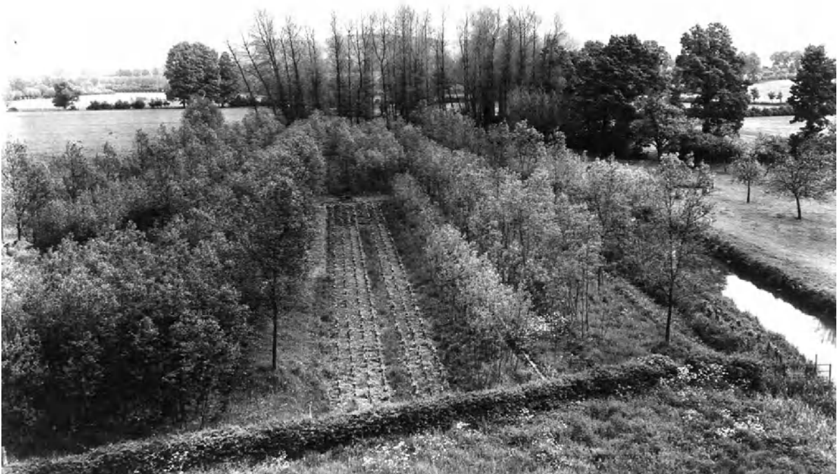
Figure 5 A view of the plantation (presumably taken from the railway viaduct) showing rows of sets and more mature trees. The bend in the river is at the far end.