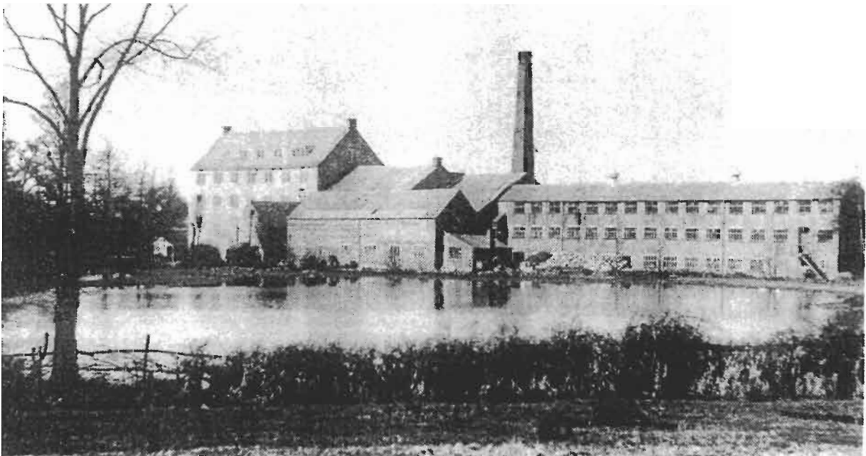
Figure 5. The final addition to the Hicks's empire, Meadow Mill, operational by 1811. Most of the buildings to the right were later additions, as was steam power.