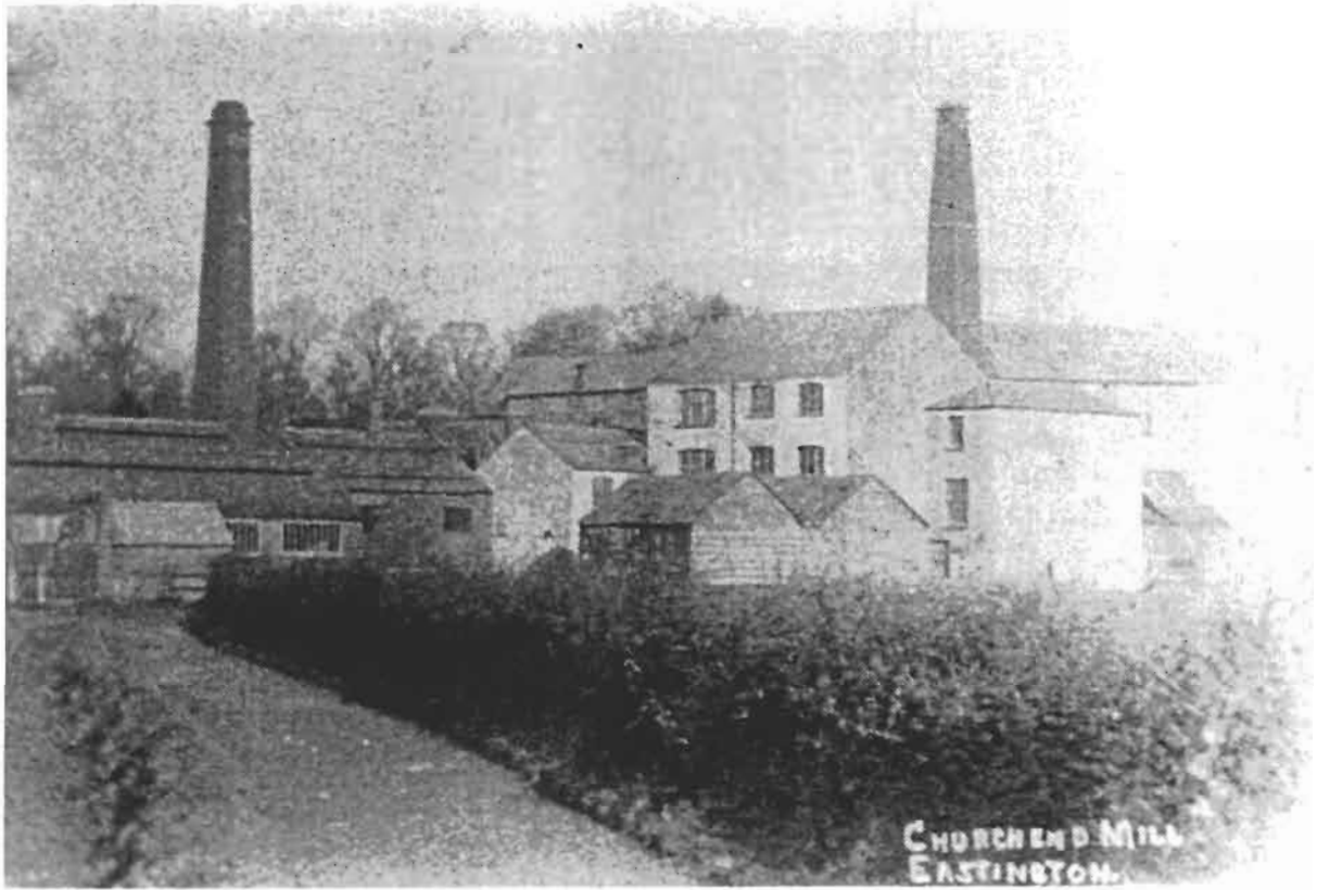
Figure 2. The Churchend Mill site, c1880, packed with buildings. The engine house is on the right, attached to the 3-storey block.