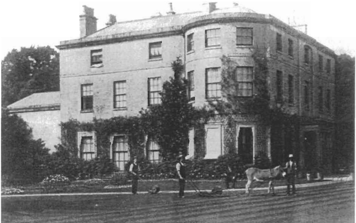
Figure 3. The Leaze, now Eastington Park, the Hicks' family home, c1900. Later inhabitants included the Marling and De Lisle Bush families.