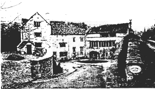
Kings Mill. 1985.

workforce was carefully segregated, with women used exclusively for sorting, counting, weighing, wrapping and labelling, all considered to be "clean" duties. The works was almost fully self-sufficient, even to the extent of drawing their own wire, one of the few in England to do so. Like some of the competition, Savory's printed all of their own packaging and made their own japan and cardboard boxes and crates on site. The range of hair pins produced in the idyllically-situated factory was wide, with stocks being held in London depots and other agencies throughout the country; from these, much went to export. In 1910, the company took over the pin-making concern of G P & C J Watkins at Kings Mill. Kings Mill was still reliant on an overshot water wheel for its power.