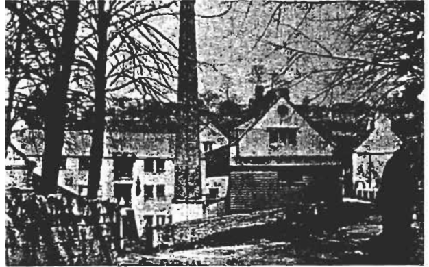
Brookhouse Mill. c1900