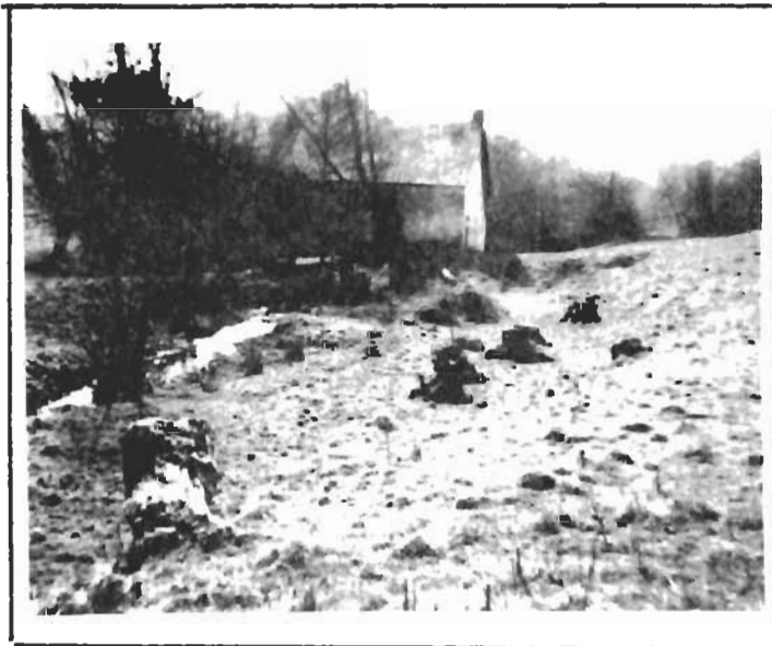
WASHBROOK MILLS in 1961

The Little/Upper mill from road bridge: willow stumps show edge of former pond.