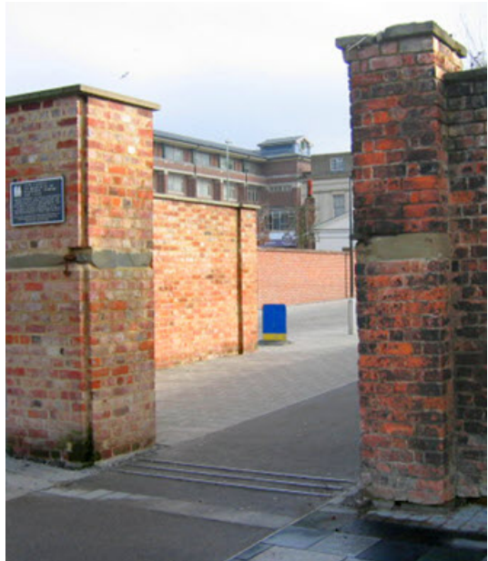
Tramroad entrance to Gloucester Docks from Southgate Street in 2011 - looking east following restoration in 2009

In 2010, as part of the interpretation of the heritage of Gloucester Docks, two replica wagons (sometimes referred to as trams) were installed on the original line of the tramroad near the entrance to the docks off Southgate Street (see cover). The wagons are mounted on cast-iron rails on stone sleeper blocks, both of which had been recovered from other parts of the line some years ago in the hope that they would eventually be on public display. The rails had recently been in the care of the Waterways Museum at Gloucester. The commemoration of the tramroad using replica wagons was first proposed by David Bick as long ago as 1991. However, the recent developments in the docks prompted Dr Ray Wilson, with the full backing of GSIA, to resurrect the scheme and seek the necessary funding which has come from the South West of England Regional Development Agency. The wagons were built by Dorothea Restorations of Bristol, to a design by David McDougall based on early photographs of wagons in use on the Leckhampton section of the tramroad.