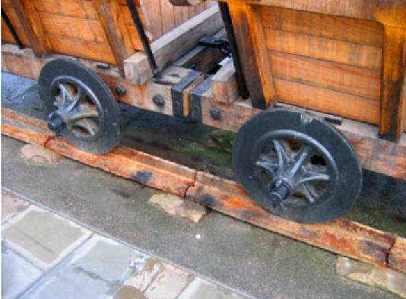
Reused stone blocks and cast iron rails under the replica tramroad wagons in Gloucester Docks

Street, Old Tramroad, Park Road and Trier Way to Horton Road (Tramway Crossing [SO842182]). It continued to Armscroft Road and along Elmbridge Road to follow the eastern side of what is now the B4063 road from Gloucester through Staverton to Arle Court [SO911217] on the outskirts of Cheltenham. The final two mile stretch followed what are now the A40 and B4633 sections of Gloucester Road as far the terminus and depot by the